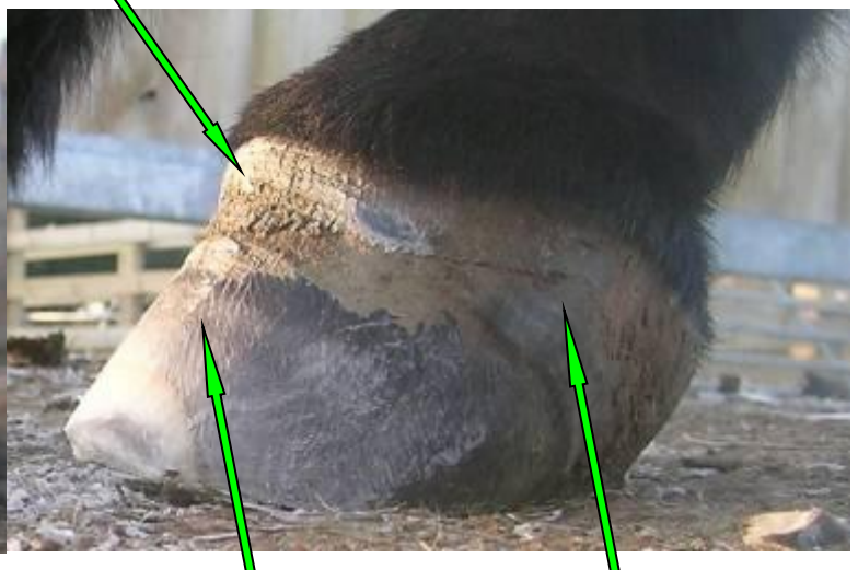
Rasped hoof wall